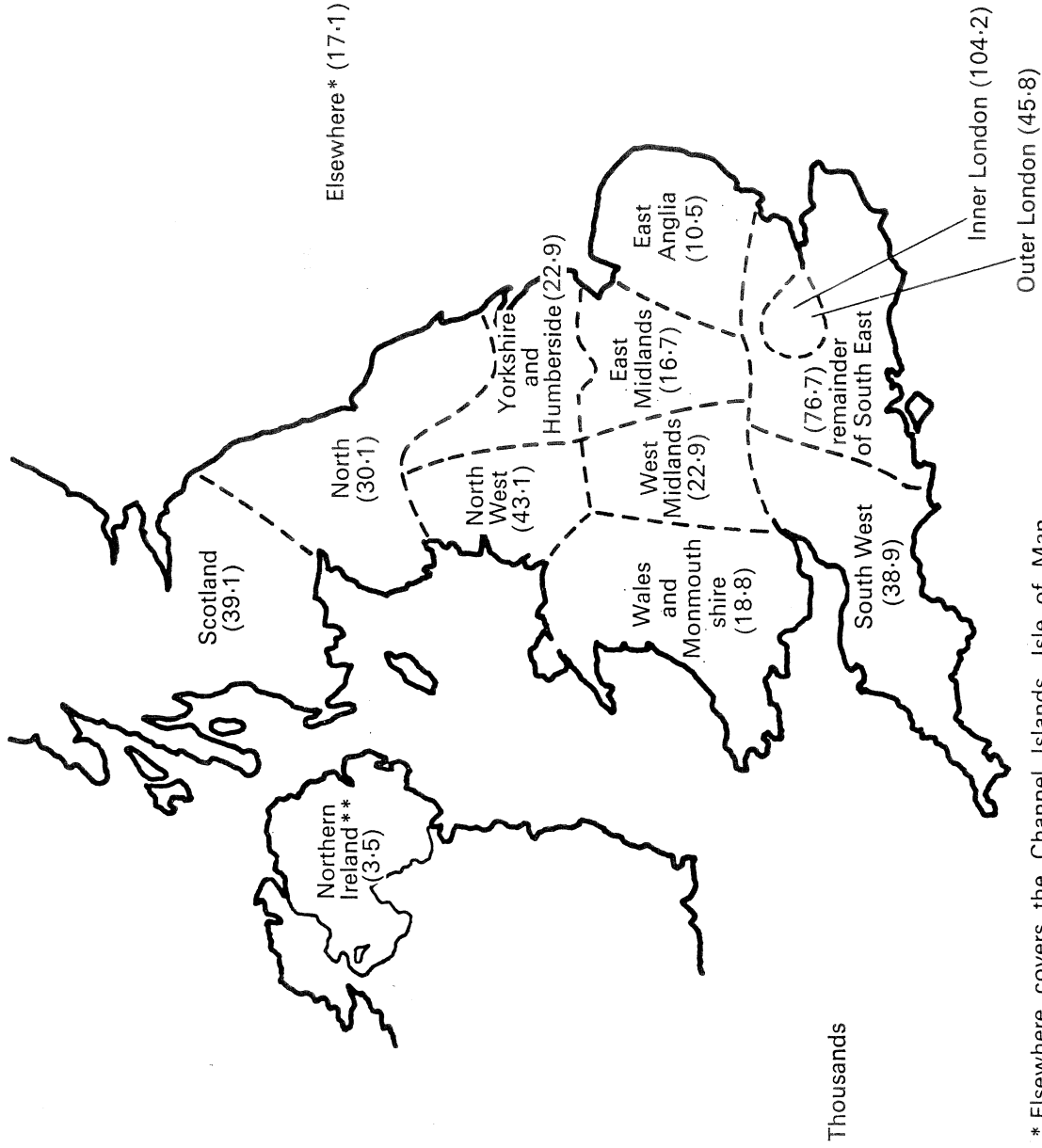
Distribution of Non-Industrial Civil Servants at 1 January 1970 Diagram C

* Elsewhere covers the Channel Islands, Isle of Man, home-based civil servants serving abroad, and itinerant staff.